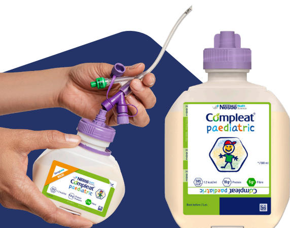
PEG tube not supplied

Unsuitable for Cows' Milk Protein Allergy